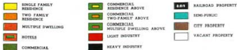
PRESENT LAND USE